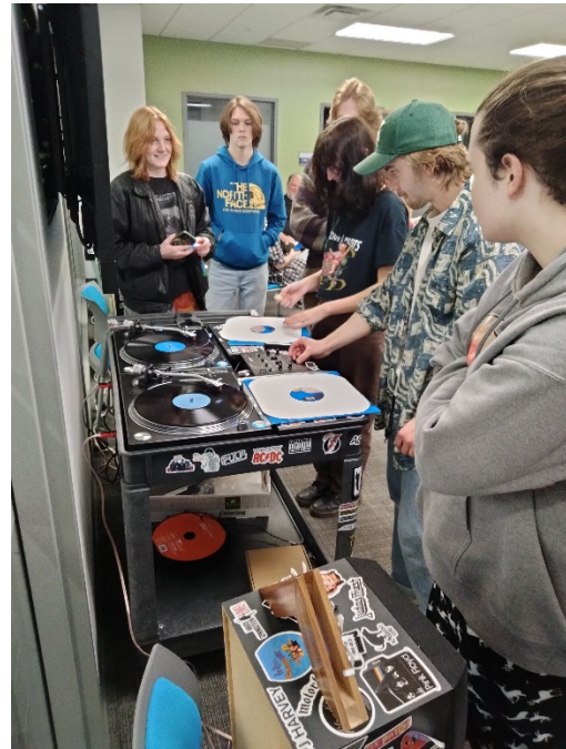
PHOTO: The VRC attempt "Double Weezer" by syncing the same song from two albums simultaneously

In the early days of VRC, we used my personal equipment, which I left in the unused classroom of A&S. We had two separate systems: an Audio-Technical LP5 paired with a Yamaha amp, and a Technics SL-D20 and a Technics amp. Each system was hooked to some badly deteriorated JBL studio monitors (I have since restored these).