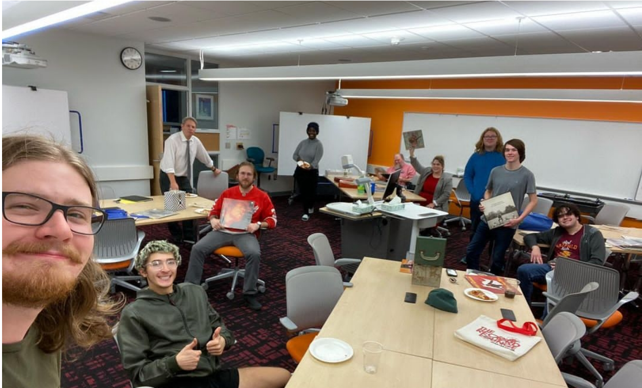
PHOTO: LCC's Vinyl Record Club meets in the first meeting space at A&S on November 5, 2022