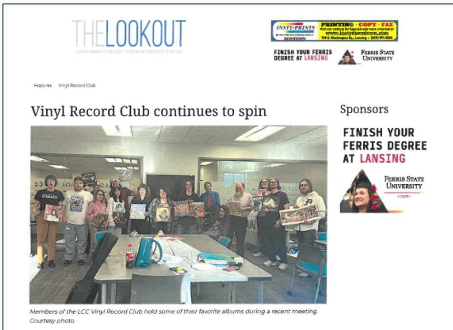
PHOTO: The VRC as featured in The Lookout , April 7, 2023.